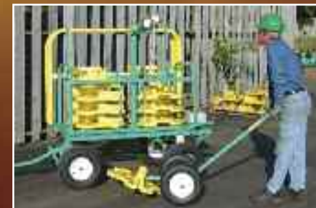
Position base under winch.