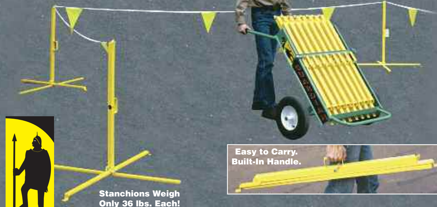
Easy to Carry. Built-In Handle.