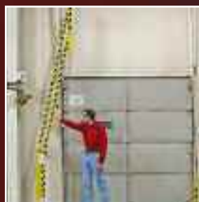
Auto Locks In Up Position.