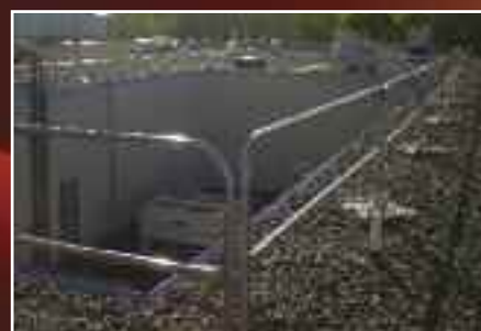
Galvanized Rails & Bases