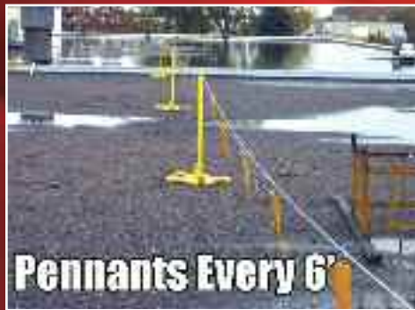
Pennants Every 6'

"It's the Best Low Cost Solution to Guard Hazards and Create Control Zones."