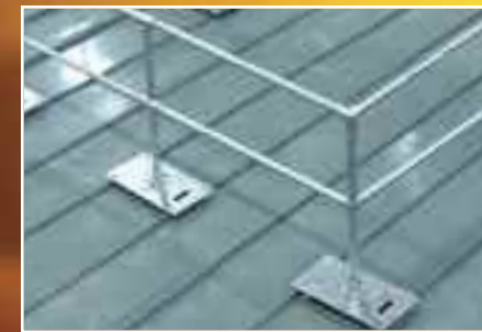
Standing Seam Roofs