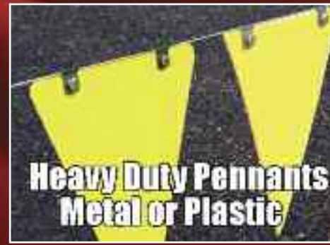
Heavy Duty Pennants Metal or Plastic