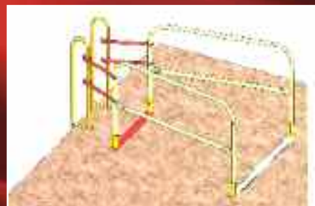
Flat Roof Installation (4) Brackets Attached to Rail