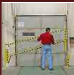
Gate Raises UP Not OUT!