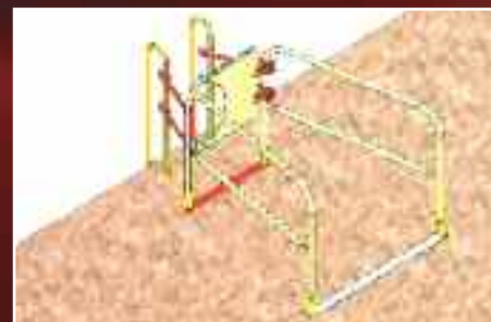
Flat Roof with Self-Closing Gate