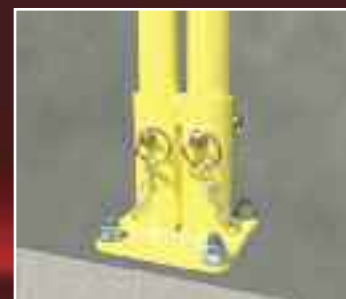
Double Floor Mount Rail Holder