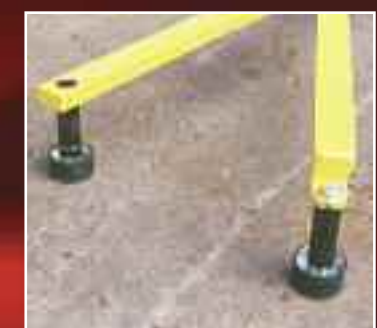
Optional Rubber Feet For Metal Decks.