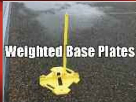
Weighted Base Plates