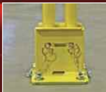
Box Style Floor Mount