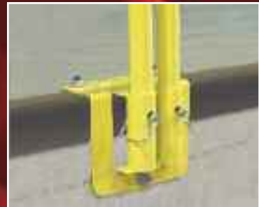
Wrap-Over Edge Mount