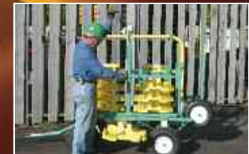
Winch base up above frame.