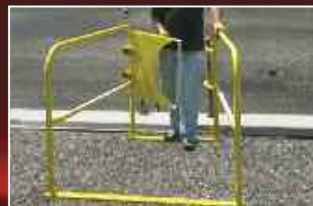
Self-Closing Gate (Optional)