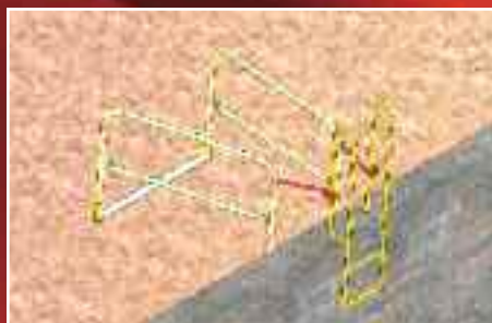
Parapet Wall Installation (2) Brackets Attached to Rail