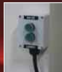
Push Button Control