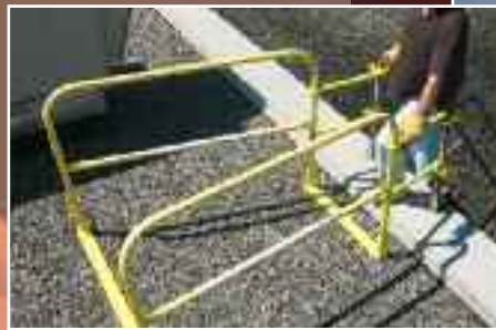
OSHA Compliant Safety Barrier