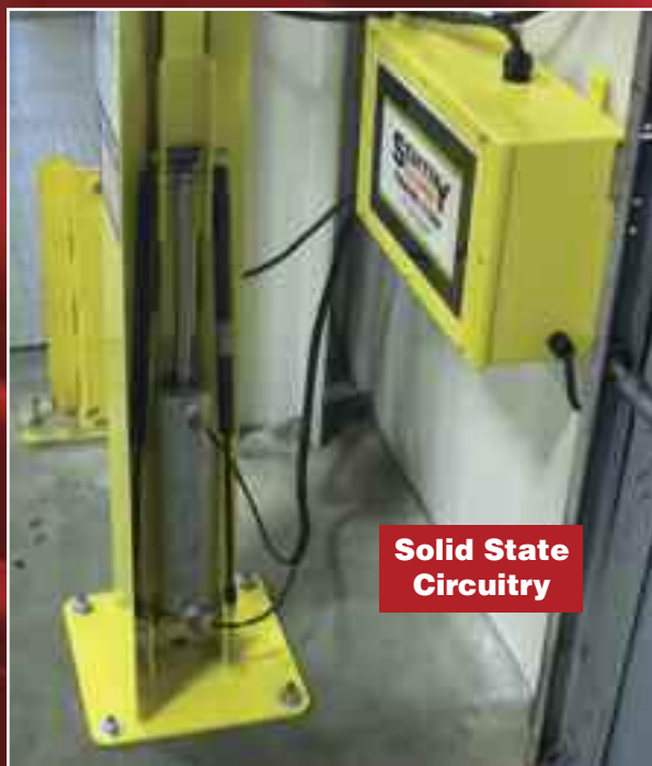
Solid State Circuitry

Want raising and lowering the gate to be even easier? You need the SentryGuard POWERED Cantilever Gate. This option uses your building's air supply to lift and lower the gate. Activate using a push-button remote control mounted on your forklift and on the wall for dock workers. A high-visibility warning strobe runs anytime the gate is activated.