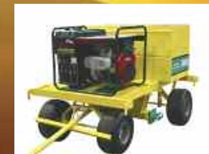
Carry Generators or Compressors