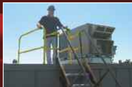
Non-Penetrating Attach In Minutes!