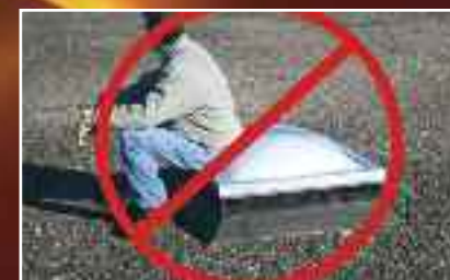
Unprotected skylights are an OSHA violation.