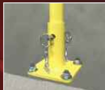
Single Floor Mount Rail Holder