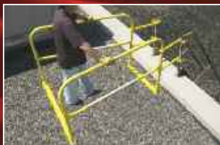
Creates a Safety Egress and Ingress Zone.