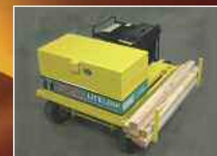
Material Rack (Optional)