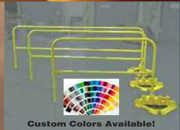
Custom Colors Available!

Rail Sections are 42" high and are available in three standard lengths: 10', 7'6" and 5' lengths. Railing sections feature solid-bead welding, heavy-wall construction and a super-tough, safety yellow, powder coat finish.