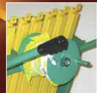
Built-in Reel Holds 300' of Flagged Line.