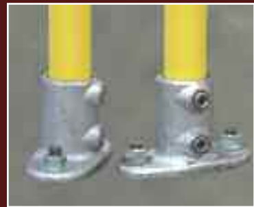
Zip-Base Floor Mount