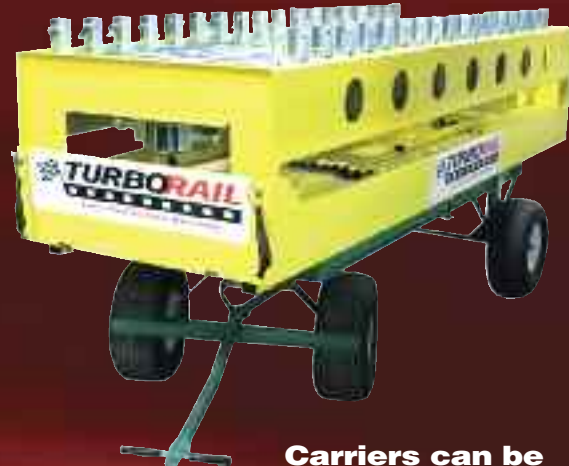
Carriers can be moved with a forklift or crane (wheeled cart pictured is optional)