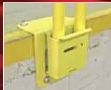
Box Flush Mount

RailGuard 200 permanent mount systems share all the standard features of our portable models. Look all you want, you won't find a better built system or a more rewarding company to do business with.