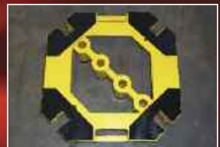
Rubber Skids (opt.)