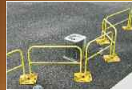
Protect HVAC Equipment