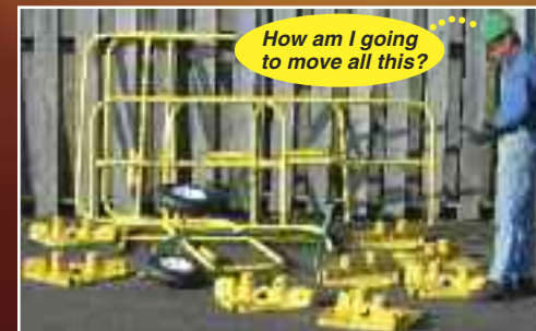
Neatly Store ALL This!