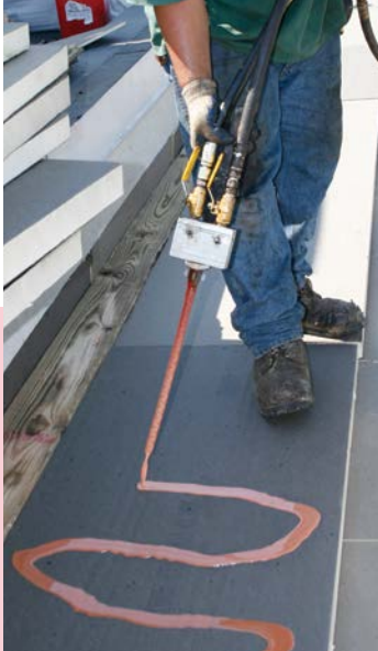
OlyBond500 makes big jobs seem small...and small jobs even easier!