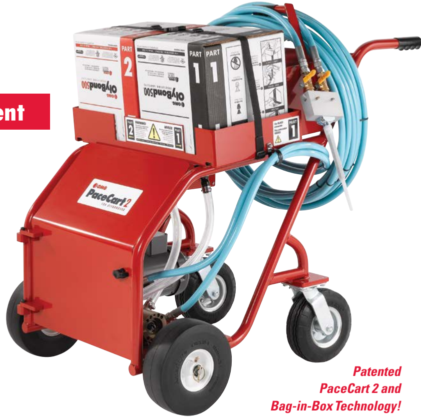
Patented PaceCart 2 and Bag-in-Box Technology!

OMG Roofing Products, the most trusted name in adhesive insulation attachment, also offers a large selection of innovative application equipment.